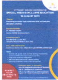
PHILSSET Reserach Conference (1).png 456K